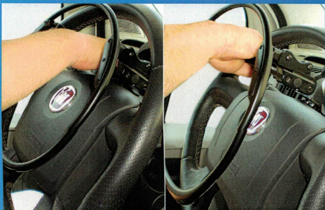
Quick release functionality